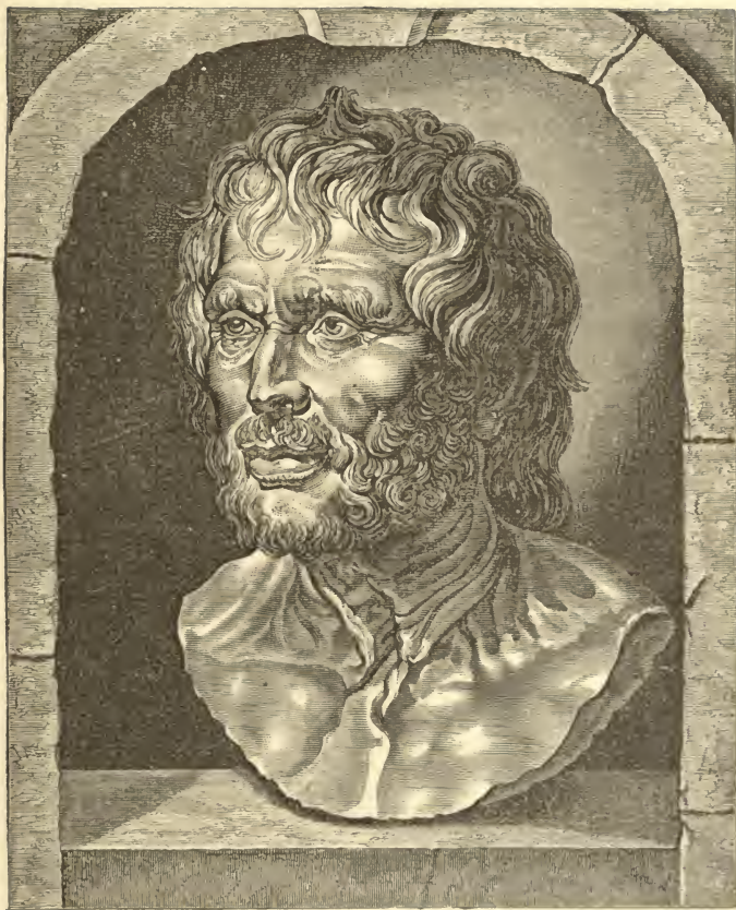
LUCIUS ANNÆUS SENECA.